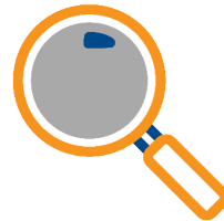
Root Cause Analysis